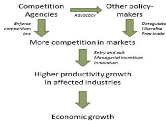
Figure 1. Competition and Growth, OECD (2013)