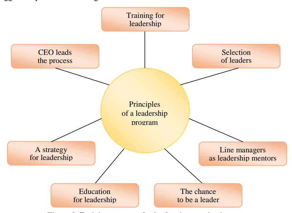
Figure 3. Training program for leaders in organizations

John Adair, a globally recognized authority in the field of leadership and management personnel development, finds that the leadership activity involves the application of certain principles. Such principles are not rules or logical steps of a plan, but general statements, universally or largely considered as true and fundamental (Adair, 2014). In other words, any training program for leaders in organizations should be governed by a number of fundamental principles, suggestively illustrated in Figure 3.