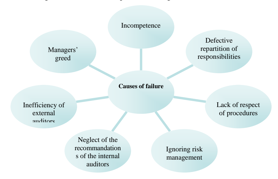
Figure 1 Causes of companies' failure

"You cannot expect that those who administrate other people's money to be just as careful and attentive as they were with their own" (Smith, 1976). All around the world there are companies involved in famous financial scandals, such as: WorldCom, Parmalat, Anderson, Enron, Xerox, Merrill Lynch, Allied Irish Bank, Alder Hey, Sellafield, Maxwell, BCCI (Bank of Credit and Commerce International) etc. The causes leading to these scandals are presented in figure 1.