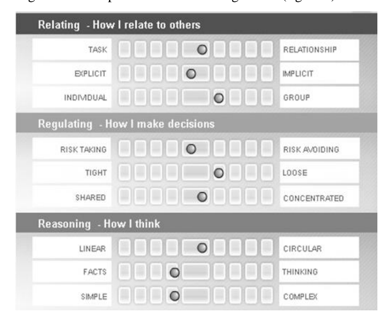
Figure 2 Cultural profile of the Romanian organization

First analysis of the cultural profile is made on the Romanian company. We collected 11 questionnaires which were filled by a representative sample of this company's employees, including managers. The insertion of the information in Country Navigator Profiler provided the following result: (figure 2)