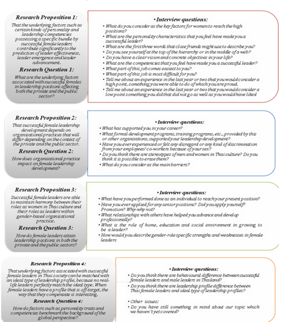
Figure 3 The interview questions which relate to the Research Propositions and the Research Questions

The interview questions were related to the research propositions and research questions and also to the relevant theories draw from the literature reviewed, as shown in Figure 3.