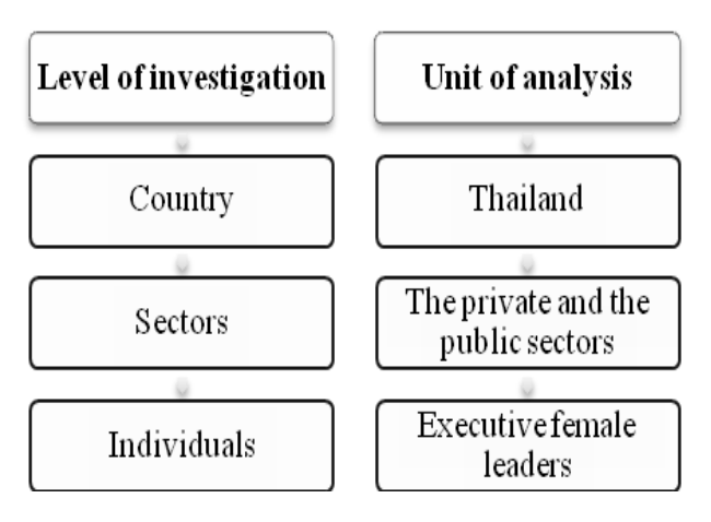
Figure 1 Unit of analysis