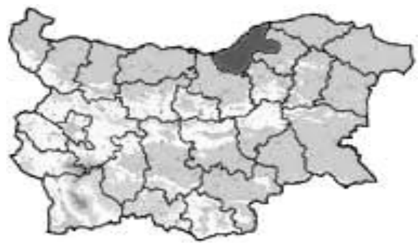
Figure: 2 Rousse region (Bulgaria)

The survey was implemented on the basis of a prior drown organizational plan, which specifies the units and the period of the survey, the method of recording and presentation of data, the forms of organization of the survey, the place of the survey, the likelihood of admission of errors etc. The sample consisted of small and medium enterprises from different sectors, which are situated in Ruse, Northeastern Bulgaria (see Fig. 2). Units of the survey have been 50 companies. The crucial moment for the survey was 01.04.2009 and the applied forms of organization were the self-survey and the correspondence form, in which data had been collected by means of a questionnaire within a certain deadline with a preventive logical and arithmetical check.