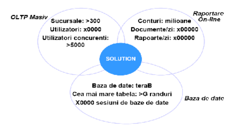
Figure 6. Scale migration project core-banking system with BCR, taken from [14]

Project size can be estimated by the number of territorial units (over 500 units, with more than 300 branches), the volume of processing daily user sessions and competition that had provided the new system, as represented in Fig 6, taken from [14]