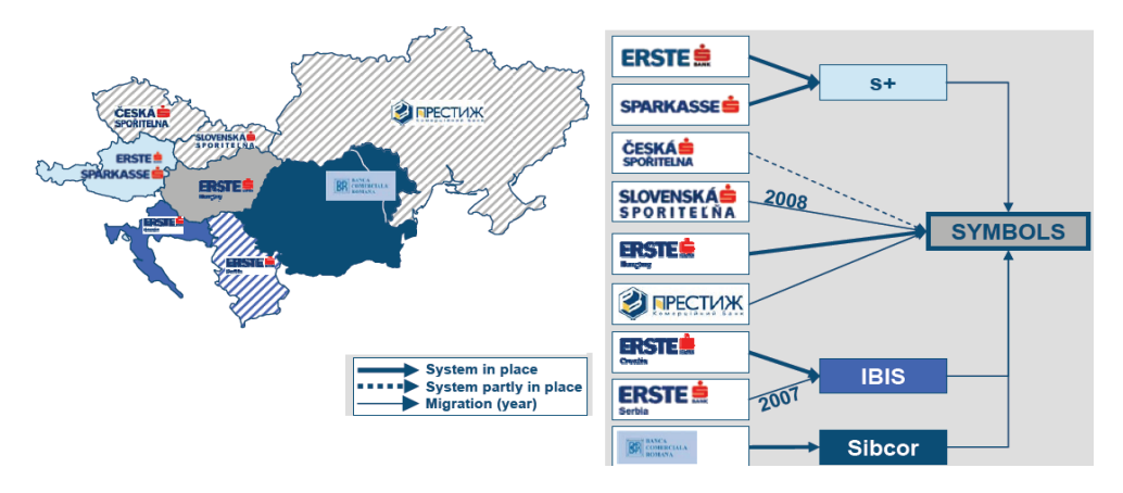
Figure 7. Core-banking system in the Erste Bank Group, taken from [16]

In the retail-banking sector , BCR acquired Loxon credit management solution [11] and opted for management credited with industry leading products Ingenio [9].