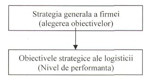
Fig. 1.2 Poziționarea obiectivelor logistice

As a provider of services, logistics, to build an efficient system needs to know from the very beginning the nature of its objectives. Guidelines derived from the general strategy of the organization, logistics sets guidelines in accordance with the performance target. In particular levels of strategy should be defined not only encompassing market expectations, but performance competition. Therefore an efficient logistic system is built starting from a clear definition of its objectives in terms of services.