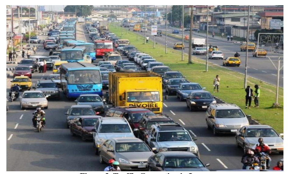
Figure 3. Traffic Congestion in Lagos

Traffic congestion is a very serious socio-economic nuisance caused by IPT providers, their blatant disregard for the safety of their passengers, especially, at pick up or drops off points is worrisome, disrupting traffic flow, particularly, at peak hours.