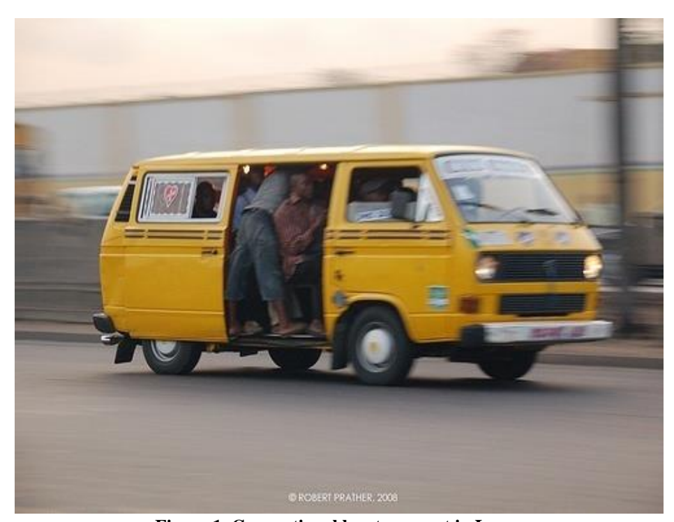
Figure 1. Conventional bus transport in Lagos