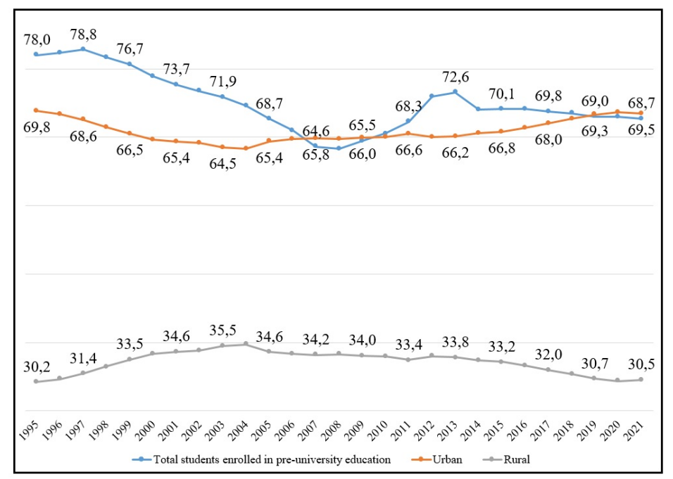
Figure 2. The evolution of students enrolled in pre-university education in Romania, %

For Romania, the following figure shows the evolution of students enrolled in pre-university education from the total school population (%). The figure also shows the evolution of students depending on the urban/rural area of residence (%).