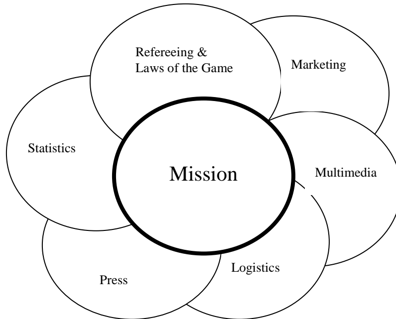
Figure 2: The Transactional Network Structure of Liga Economistului

communication channels. The students who were interested in becoming volunteers were asked to list the departments they would mostly like to be active in. After the finalization of the recruitment process, the volunteers were delegated to the departments. Eventhough vertical hierarchies were set aside, the initial thought was that each department would have a coordinator, who would cooperate with the organizers who had been next to the competition before.